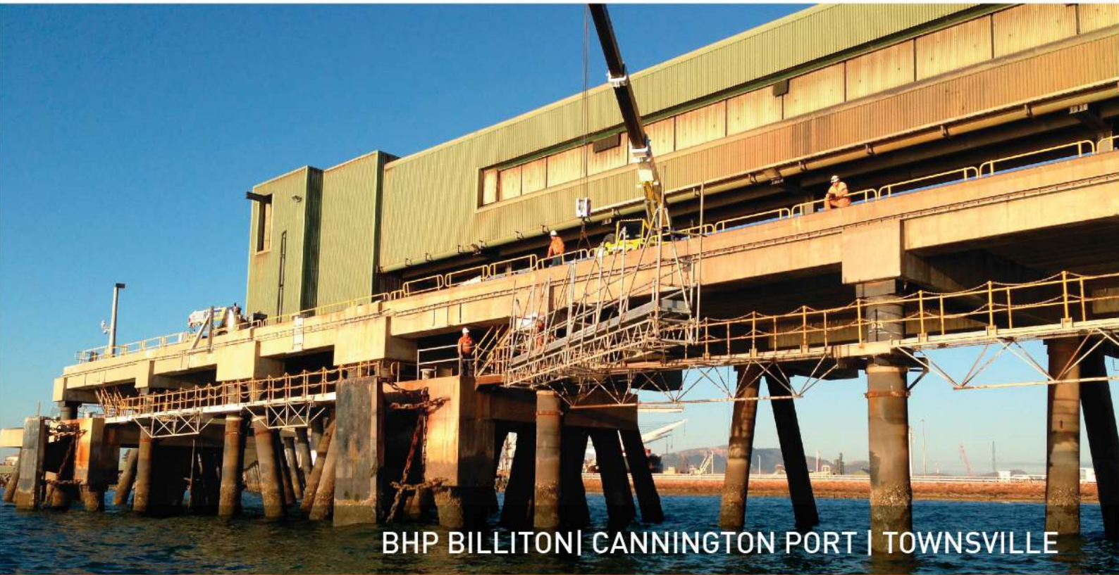
BHP BILLITON | CANNINGTON PORT | TOWNSVILLE